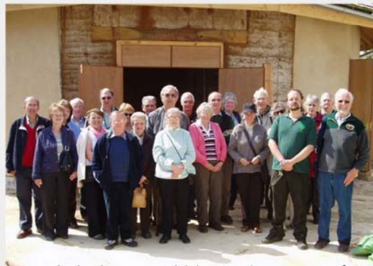
Visiting Hill Holt Wood

Lindsey U3A website: http://community.lincolnshire.gov.uk/LindseyU3A/