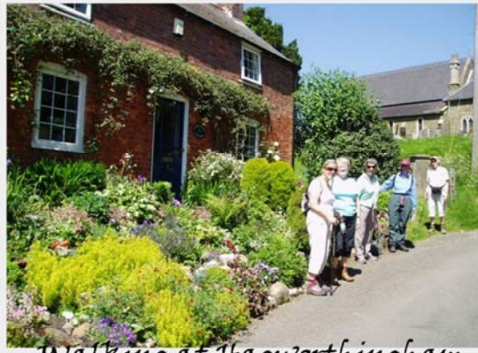
Walking at Hagworthingham