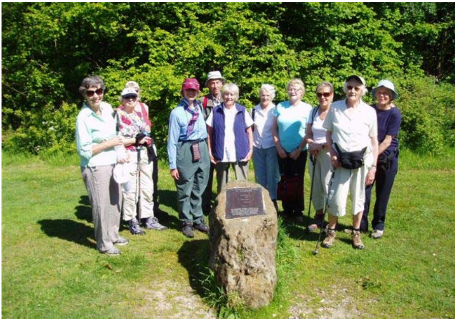
The photograph shows the group in front of the Greenwich Meridian stone in Snipe Dales conservation area.