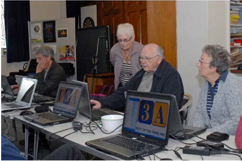
Learning IT at the Photo Group